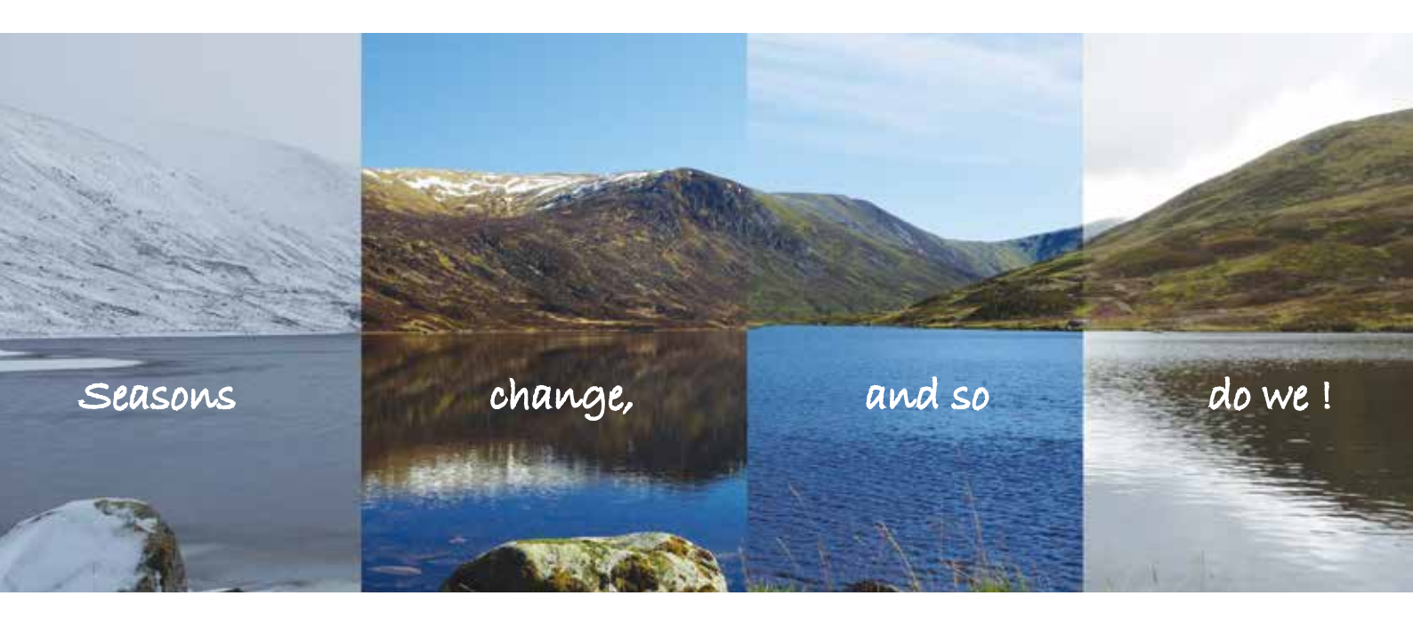
Austria • Belarus • Belgium • Cyprus • Czech Republic • Estonia • France • Germany • Greece • Iceland • Ireland • Lithuania Luxemburg • Norway • Poland • Portugal • Slovenia • Spain • Sweden • The Netherlands • Tunisia • Ukraine • United Kingdom